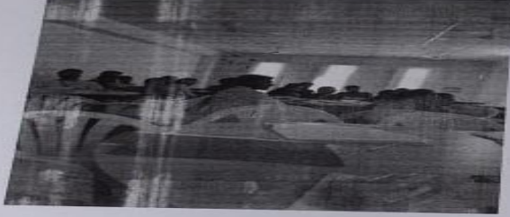
3 yr B.tech students in G.D.

J A M on Love for Mother tongue and Don't let your Mother tongue Die"